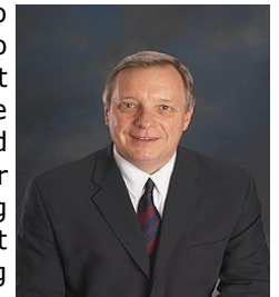
(Senator Dick Durbin)

Our voice was heard when the Senate voted 64 to 33 in favor of Senator Dick Durbin's (D-IL) amendment which authorizes the Federal Reserve to undertake a process to establish that debit interchange fees shall be reasonable and proportional to their actual cost. Addressing these fees will benefit our customers by driving down the cost of doing business.